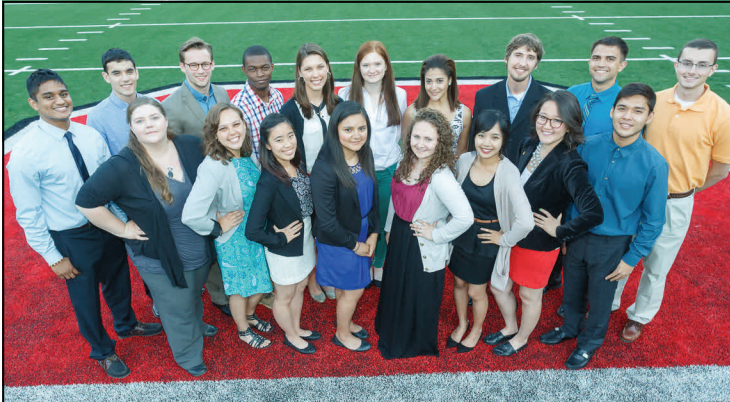
2014 SUCCESS Class